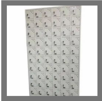
MS Office Storage Lockers