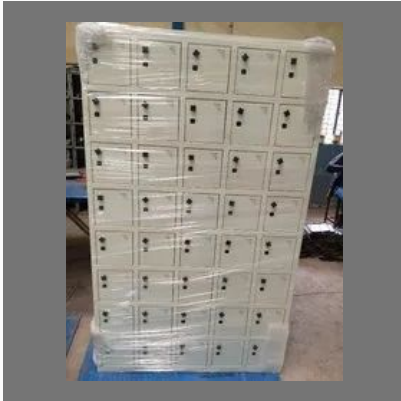
Call Phone Locker 40 Cabin