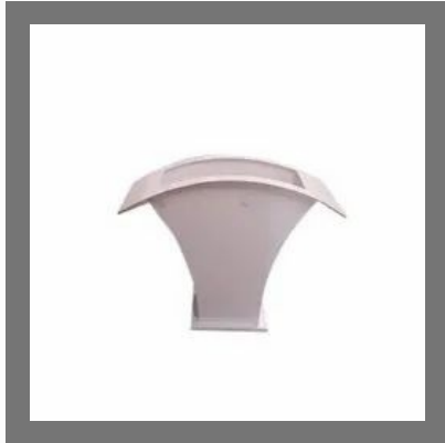
MS Tyre Display Stand