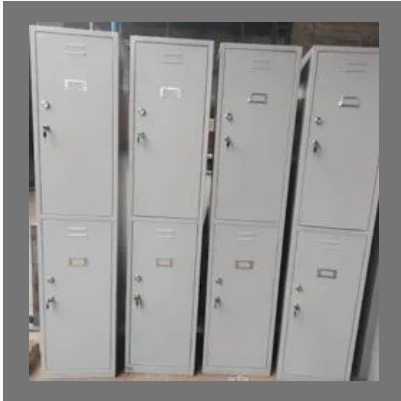
Hotel room locker