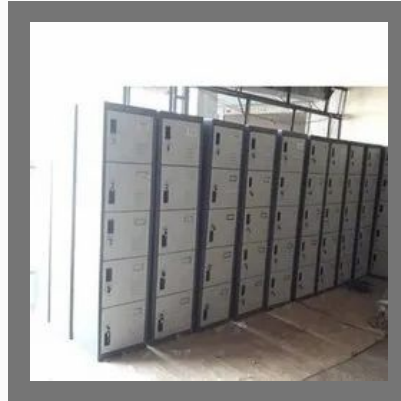
MS Industrial Changing Room Locker