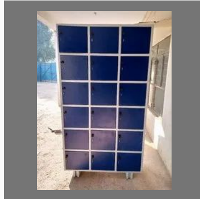
Office storage locker