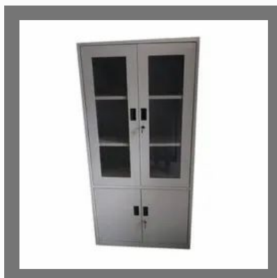
MS File Cabinets