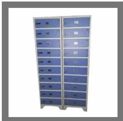
MS Laptop Office Lockers