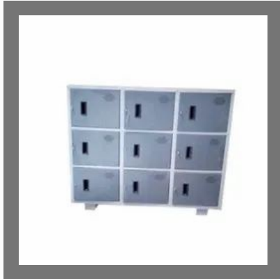
MS Storage Lockers