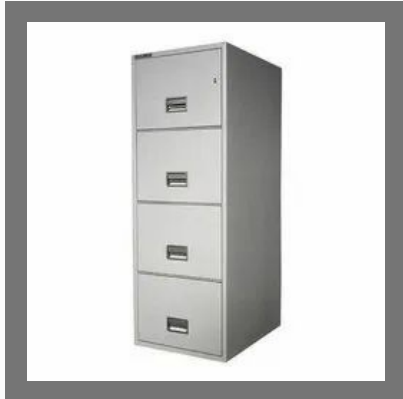
Metal Office File Cabinets