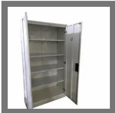
Color Coated Mild Steel Almirahs