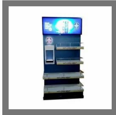
LED Display Stand