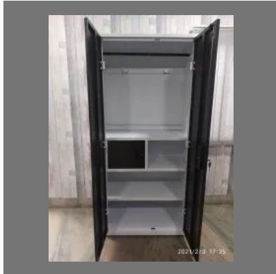
Almirah Home Use