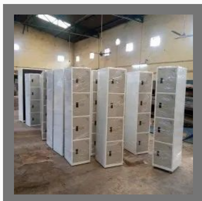
School Storage Locker