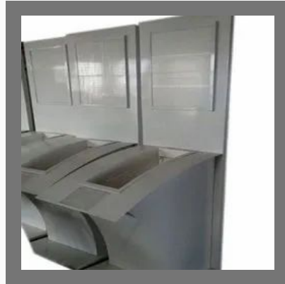
MS Tyre Display Stand