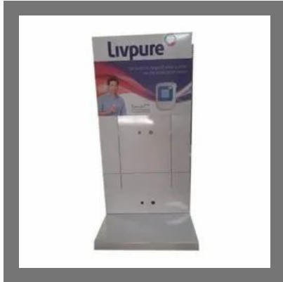
Promotional Display Stand